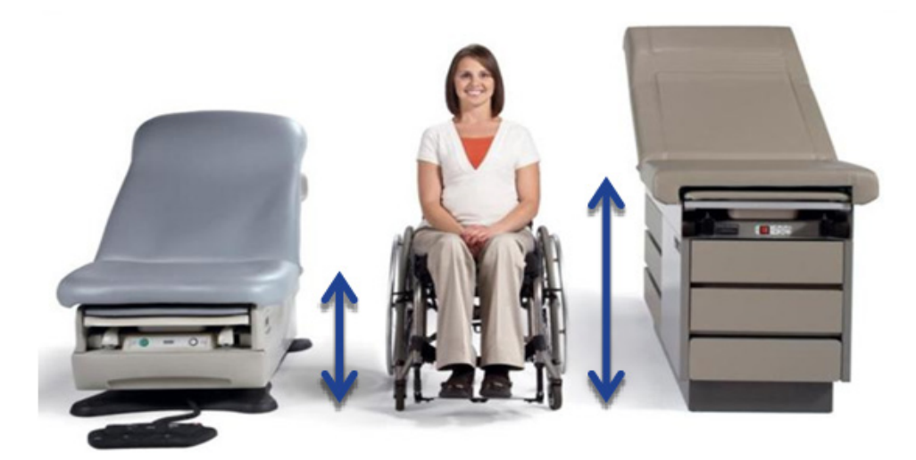
Accessible Transfer Height Range of 17 to 19 inches.