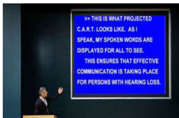
CART is provided on a large screen at a conference.