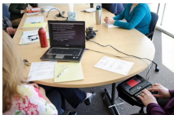
CART is provided for an individual on a personal laptop at a work meeting.