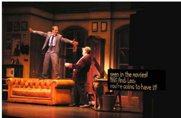
Closed captioning is provided for an audience at a live theater show.

Under the ADA it is also important to know that auxiliary aids and services may need to be provided to spouses, partners, family members, and close associates with hearing loss. For example, if your spouse has a court appointment, you as a family member with a hearing loss would have rights under the ADA to require an auxiliary aid or service to be able to participate and have full communication access.